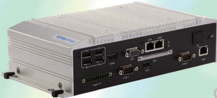
PE4000B Atom™ N2600 Model