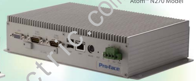
PE4000B Atom™ N270 Model

Highly compact IPC empowering your applications